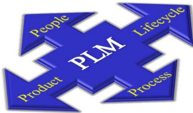
Figure 1: PLM Expansion and Evolution

Most manufacturers that invested in PLM have accomplished the first objective of their PLM implementations – getting their product data under control. Now, they have expanded on that and are developing the “one source of truth” for product data that leading manufacturers envisioned in the late 1990’s. As PLM implementations have matured, manufacturers have leveraged the core capabilities and extended PLM to new sources of value. The scope of PLM has expanded to include more people, more parts of the product lifecycle, and more aspects of the product (Figure 1). The solution has also grown to support more business processes such as product compliance and service management. At the same time, the information included in PLM has expanded to a much richer view of the product, now frequently including commercial information in addition to technical specifications. This evolution has significantly expanded the potential value of mining this information to make better business decisions